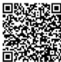
Take our Placement Test

inlingua Victoria has been providing programs and services in post-secondary vocational education, academic transfers and pathways since 2012.